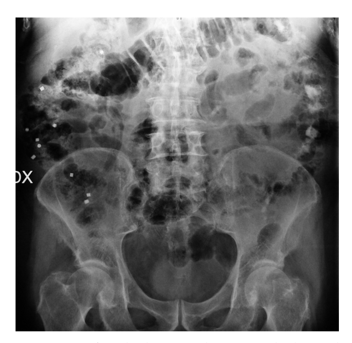
Fig. 1: Gastrografin and radiopaque markers are over the ileum-cecal valve. The patient demonsted to have a partial obstruction episode.

In all 16 cases our contrast study demonstrated a partial obstruction according to the estabilished criteria (Figs. 1 and 2). We obtained almost the same results in all of them after 24 hours.