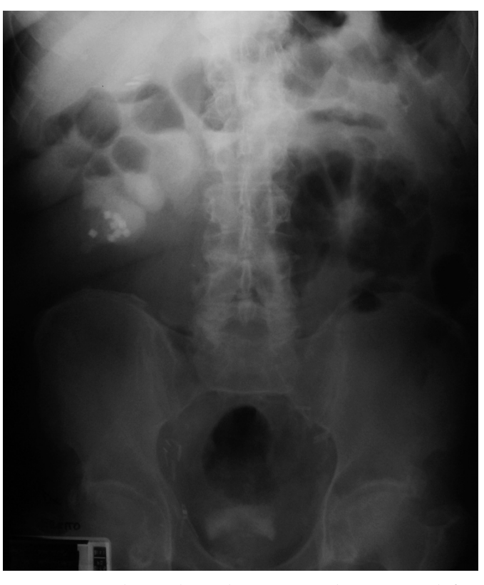
Fig.2 Patient with ascendant colectomy more than 15 years before. Gastrografin and radiopaque markers are over the right colonic flexture.