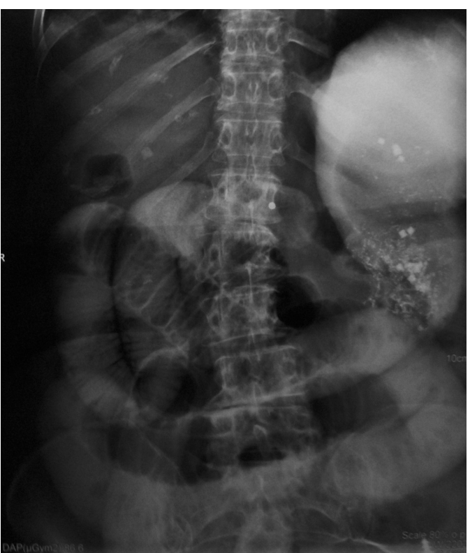
Fig. 3: Patient with an internal hernia. Gastrografin and radiopaque markers seemed to be in the small bowel and stomach. A CT exam showed little amount of gastrografin over the ileum-cecal valve.