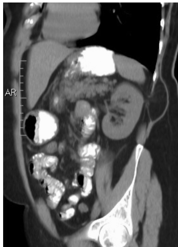
Fig. 1: CT scan: sagittal view showing a subfascial oval hypodense formation, directly connected to the abdominal cavity.

Before being hospitalized, the patient underwent allergy consultancy and was advised to take the following pharmacological prophylaxis 3 days before surgery: betamethasone 4 mg/ml injections (13 hours, 7 hours and 1 hour before surgery); ranitidine capsules 150 mg, one capsule every 12 hours for 3 days; ebastin capsules 10 mg, 1 capsule every 12 hours for 3 days. Also, the patient required a methacholine test which highlighted slight hyperreactivity whereas the spirometry tests were normal. Classified as ASA II/III, the patient was hospitalized on the day of surgery. The surgical procedure was performed under general anesthesia, with the patient put