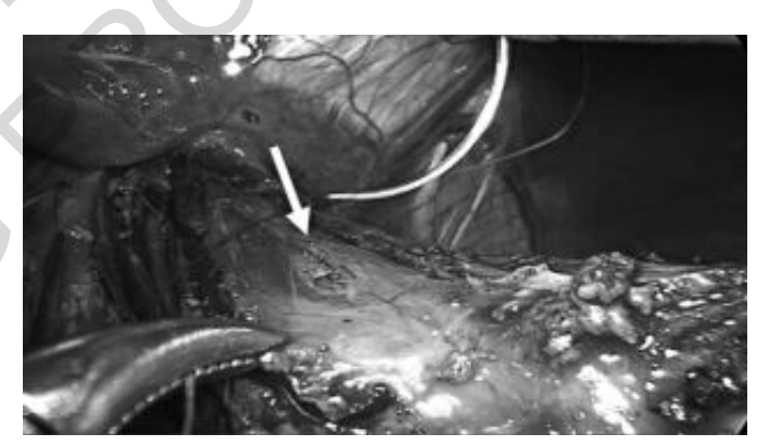
Fig. 2: Mucosal perforation indicated with the white arrow.