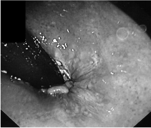
Fig. 2: Second APC session: residual warts elimination.

laser session to eradicate lesions together with a proctoscopy to rule out rectal involvement.