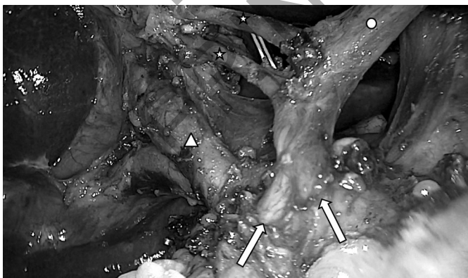
Fig. 1: Laparoscopic lymphadenectomy of the hepatic hilum. White circle: common hepatic artery. White arrows: Duodenopancreatic arteries. White stars: hepatic branches of common hepatic artery. White triangle: common bile duct.

Variants of the hepatic arteries are one of the most common vascular variations reported in literature. In 1955, Michel 3 described the first classification of uncommon presentation of hepatic arteries, that was renewed in 1962 4 . This paper was based on data obtained by the dissection of 200 cadavers. A more recent classification was published in 1994 by Hiatt et al 2 . The preoperative study of the vascular anatomy of the liver and pancreas has a primary role in HPB surgery. The CHA originates from the celiac trunk (CT) bifurcating into a right and a left branch, in 51-85.1 % of cases 1 . In a recent review of the literature we presented the incidence of the different vascular variation of the hepatic arteries. A right hepatic artery (RHA) arising from the superior mesenteric artery (SMA) was observed in 6.3-21 % of the patients who undergo to HPB surgery. A left hepatic artery (LHA) branches off from the left gastric artery (LGA) in 3-18 % of the cases. A combination of these two variants appears in up to 7.4 % of the cases 1 . The quadrifurcation of CHA has previously been described by Sureka et al. in 2013, who reported an incidence of