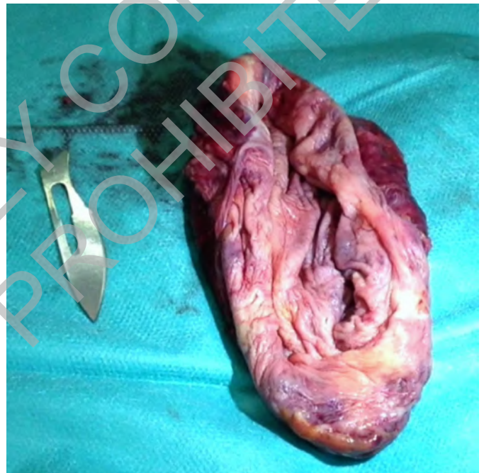
Fig. 3: Empty cyst capsule after extraction.