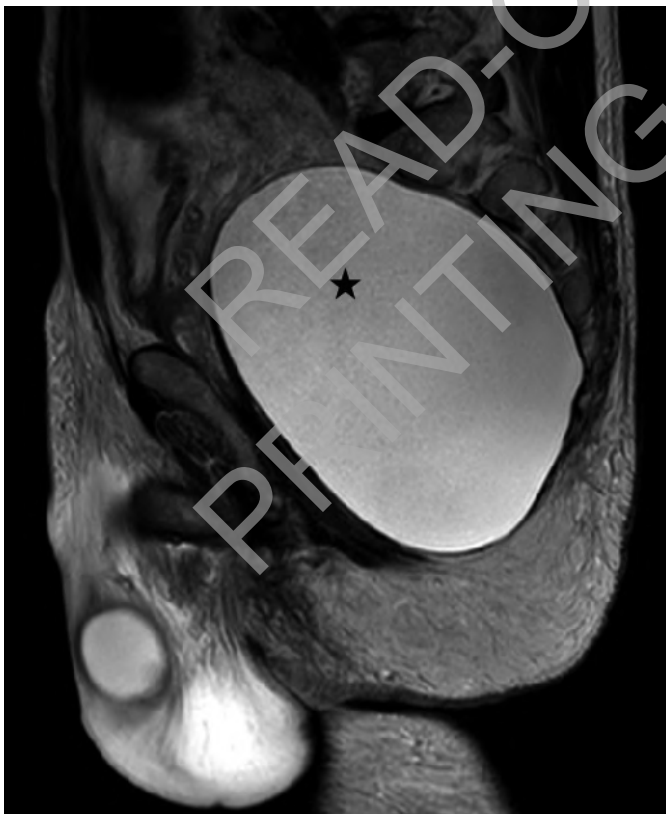
Fig. 1: RMI image of the tailgut cyst (black star).