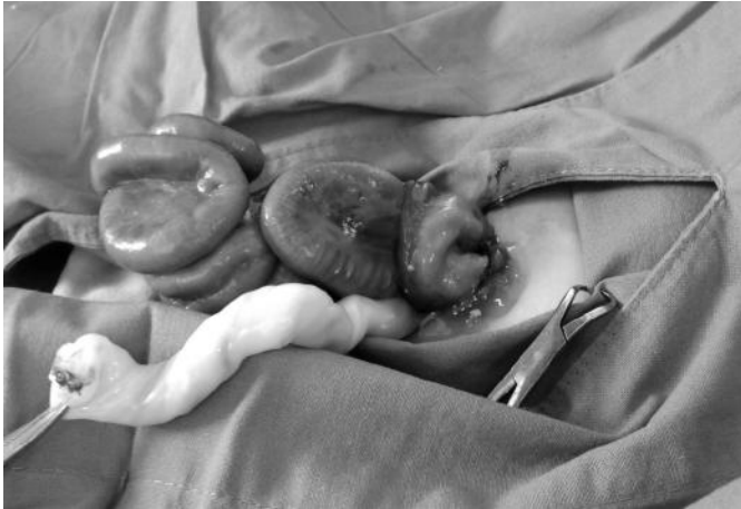
Fig. 1: Eviscerated small intestine and gaster on the right side of the umbilical cord.