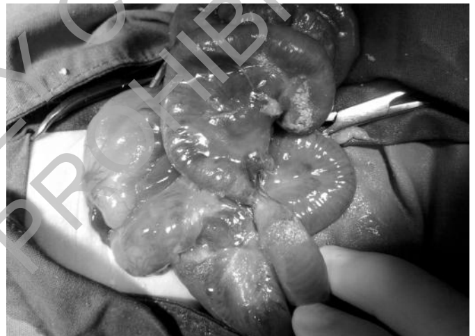
Fig. 3: Intestinal stenosis with meconium and thin fibrinous peels.

The baby received surgical intervention on the same day. A large perforation site was at the greater curvature, followed by the anterior wall of the fundus in the length of 6 cm (Fig. 2). This anomaly was found after shifting the convolutes of small bowels and removing the meconium and thin fibrinous peels. By inspection of the small bowel a thin fibrous strip that extends from the edge of the abdominal defect to the mesenterial radix