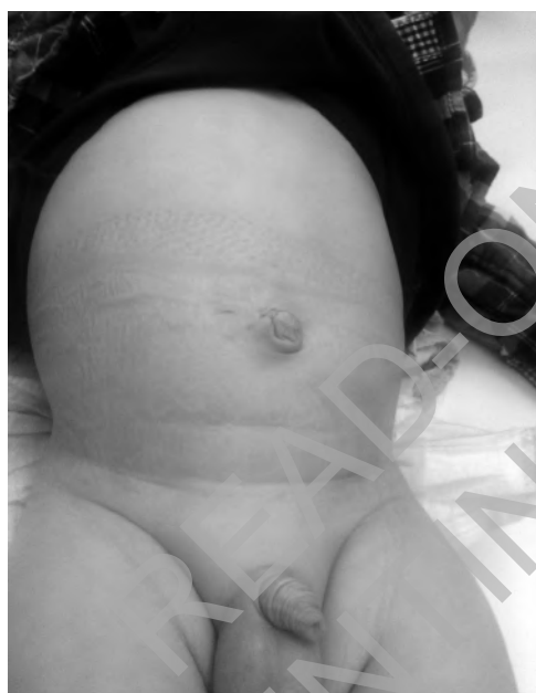
Fig. 5: Follow-up at 24 month of age.

specific mucosal enteritis and marked submucosal edema. The muscular layer was normal with ganglion cells in the myenteric and submucosal plexus (Fig. 4). The serosa was thickened with increased content of fibroblasts and collagen fibers and a layering of fibrin on the peritoneal surface. Spacemen of small bowel was 1.5 cm in length, with external diameter on resection edges – proximally 10 mm, and distally 4 mm. The lumen of the bowel was narrowed and reduced to a cleft of 1 mm in diameter.