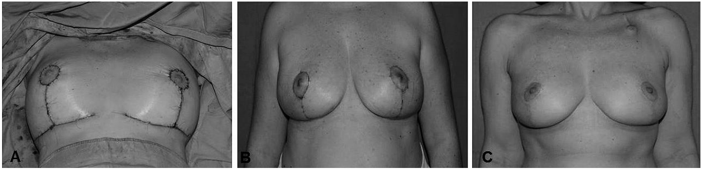
Fig. 3: A) Superficial skin-subcutis flaps closed with a non-absorbable 3-0 suture, topping the superficial ORC layer. B) Cosmetic result 2 months after surgery. C. Cosmetic result 12 months after surgery.

the role of BCS has been extended to include a group of patients who would otherwise require mastectomy to achieve adequate tumor clearance.