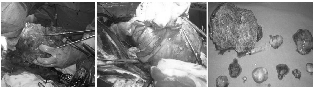
Fig. 2: Steps of surgery

1) Problem related to the mother : the choice of performing myomectomy before, during or after pregnancy in a 44 years old woman with no previous children is very difficult to establish. The evaluation must be done in