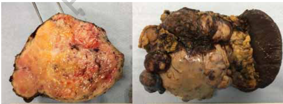
Fig. 2: Fixed macroscopic specimen of pancreatic neuroendocrine tumor.