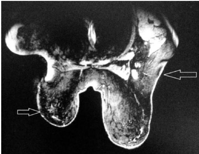
Fig. 2: R.M. bilateral breasts.

Outcomes of QUART, it is noted in the sub-scar area (about 17mm) enhancement after M. of C. There were no other places of enhancement bilaterally. In the right axilla it confirms the presence of enlarged lymph nodes with fatty hilum loss of probable pathological significance.