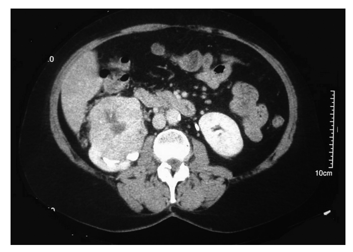
Fig. 1: CT scan showing right kidney malignancy.

Multivisceral resection has been extensively described. Simultaneous colectomy and hepatectomy for metastatic colon cancer can be performed safely, with encouraging results <sup>2</sup>. D'Angelica and colleagues <sup>3</sup> demonstrated that major hepatectomy can be performed simultaneously with pancreatectomy in carefully selected patients with accept-