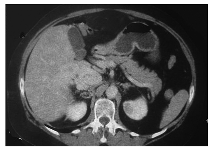
Fig. 2: CT scan showing left kidney upper pole tumour.