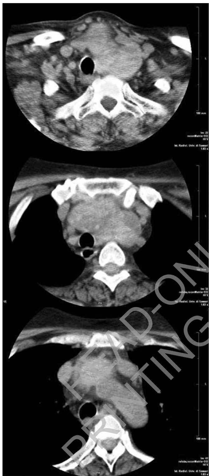
Fig. 1: CT scan sections of the neck and mediastinum of the second patient.

voluminous goiter, reaching the aortic arch in both cases and displacing the trachea on the right, as well as the epiaortic vessels (Fig. 1). The first patient presented some calcifications in the cervical part of the lesion.