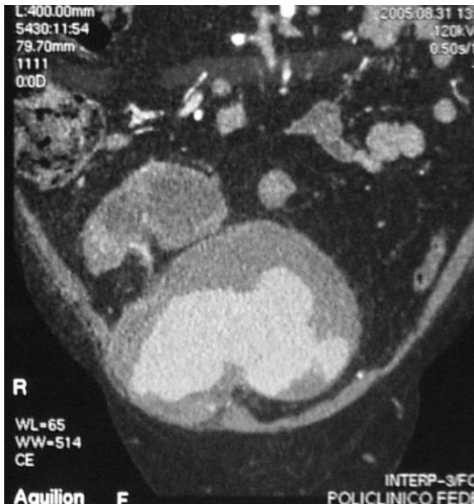
Fig. 1: Anastomotic pseudoaneurysm: Massive pseudo aneurysm from which originates renal artery of the graft filled by contrast at AngioCT coronal reconstruction study.

Siu 25 claims that small PA can be treated with conservative therapy with periodic ultrasound monitoring, as in Zavos' experience 26 concerning two patients treated with intravenous amphotericin for two months and a stent placement before retransplanting with good results in 2 years follow-up. Broken, large or infected PA should be treated surgically 27,28 . Open conservative technique contemplates direct suture or graft removal/replanting with patch or other vessels (hypogastric artery, contralateral iliac axis). These techniques are highly invasive and threaten graft survival, furthermore there is a high probability of recurrence or dissemination when PA is infected. So transplant nephrectomy is the most common technique performed in these cases for the high risks linked to the conservative techniques (including rebleeding).