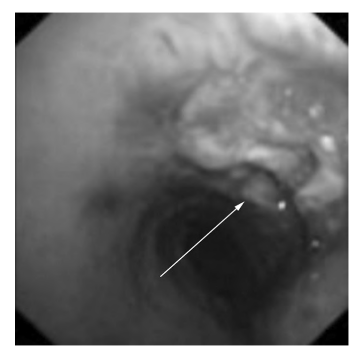
Fig. 2: Broncoscopic view shows that the lesion is confined on the right side of the anterolateral fibrocartilaginous tracheal wall (white arrow), without extension to the posterior membrane. The lesion (1.5 \times 1.5 \text{ mm}) in size) is surrounded by a ridge of granulation tissue.