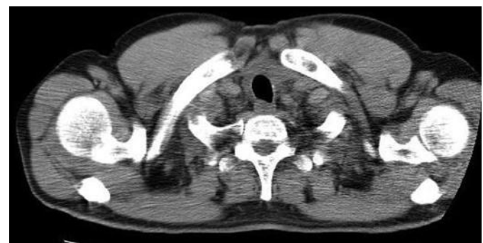
Fig. 3: CT scan performed 10 days later, reveals no-recurrence of pneumomediastinum.