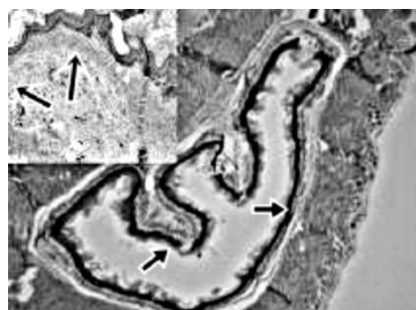
Fig. 2: Comparison of Group I (large picture) and Group II (small picture). Normal esophageal mucosa (large picture-arrows) and polymorphonuclear infiltration and collagen deposition (small picture-arrows) (H&E 100X).

The histopathological examinations in light microscope are shown in (Figs. 2, 3, 4).