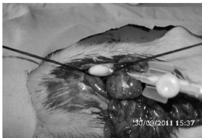
Fig. 1: Exploration of esophagus and installation of lumen with 24 F cannula.

GROUP II (The corrosive esophagitis group without treatment): One ml of 5% NaOH solution was instilled through the isolated esophagus with 24 F intravenous cannula for 3 minutes. After this procedure, the esophageal cavity was cleaned with distilled water for 1 minute.