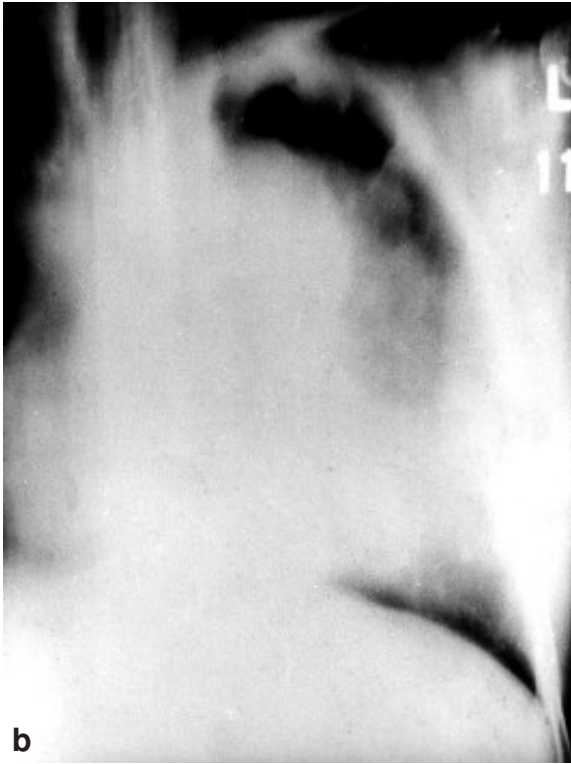
Fig. 1: Patient 1. a), chest roentgenogram. b) linear tomography. Note multiple pleural masses.

showed abnormally wide mediastinum and multiple masses in the left pleura (Fig. 1, a and b).