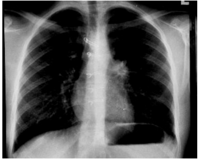
Fig. 3: Roentgenogram of patient 2 shows marked regression of the neoplasm following chemotherapy.

during the following months, the patient received local irradiation with 4500 cGy and two more courses of Cisplatin, Adriamycin and Cytophosphan. At the last follow-up 30 months after the resection, age 21, he was asymptomatic, studying and working. There was no evidence of recurrence.