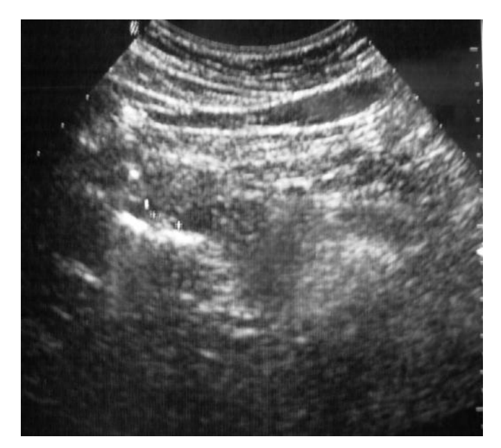
Fig. 1: Ultrasonography show a hyperecogenic endoluminal mass in the first and second portion of the duodenum.

plasia (Type III), also known as Brunner's gland hamartoma or adenoma or Brunneroma, which generally present as a single polypoid lesion, sessile or pedunculated <sup>6,14</sup>. Hyperplasia refers to multiple lesions (usually less than 1 cm) and adenoma refers to a lesion larger than 1 cm 3^{33} . Brunner's gland adenoma has a tendency to be predominant in the fifth or sixth decade of life with equal gender distribution <sup>21,34</sup>. Symptoms of the patients with Brunner's gland adenoma can be inserted into two categories: symptomatic tumors that can further be divided into haemorrhagic and obstructive tumors; and asymptomatic tumors that are only found incidentally 8,17. The most common clinical manifestations of symptomatic group are gastrointestinal hemorrhage, due to ulceration or erosion of the tumor. Obstructive tumors causing epigastring bloating, discomfort, vomiting or weight loss 6,25. There are also reports about patients who complained of diarrhoea owing to disturbances of duodenal motility <sup>24</sup>. Levine <sup>21</sup> et al studied the characteristics of