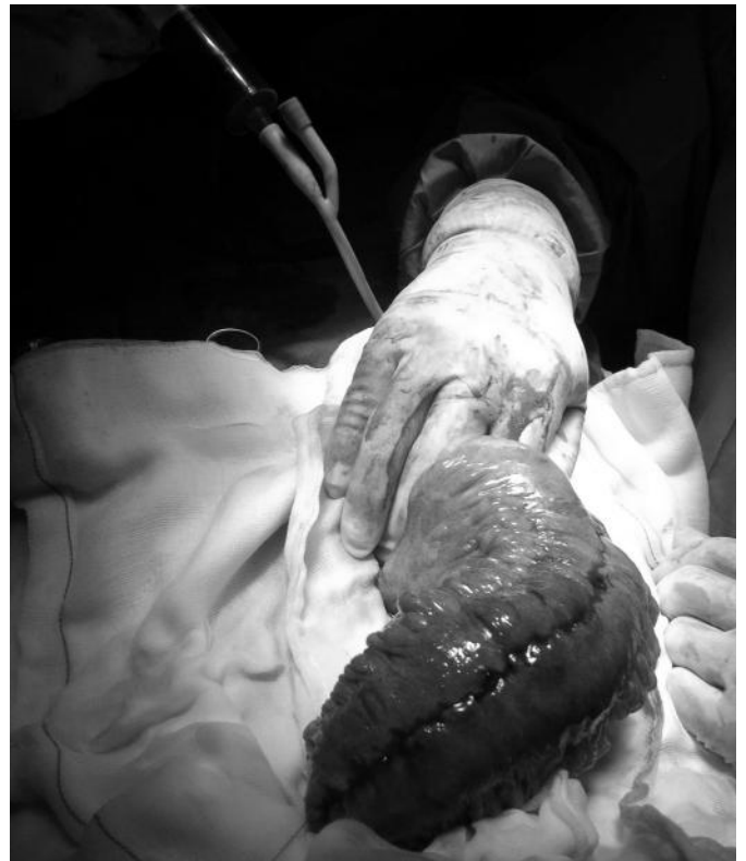
Fig. 3: Methylene blue infusion with a Foley catheter to test the posterior side of the suture line.

pouch. After firing, the anterior aspect of the staple line was carefully inspected and checked with air leakage test. Minor bleeding was controlled by electrocautery and reinforcement was achieved by siero-sierosal running suture (Fig. 2). Before closing the enterotomy a leakage test was performed using the infusion of methylene blue with a catheter (Fig. 3). A spilling of methylene blue was observed through the folded mesentery, detecting a posterior