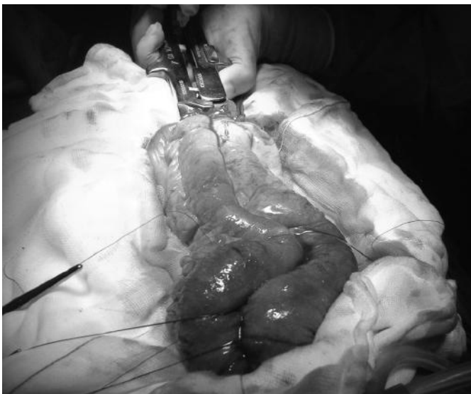
Fig. 1: Creation of a side-to-side enteroplasty by using a 90 mm stapler (GIA 90 PREMIUM™, Auto Suture™).

The patient was placed in supine position with the surgeon and the first assistant standing to the left side. Pneumoperitoneum was established at 12 mmHg pressure and a 5 mm trocar for the camera was inserted at the umbilicus. Two additional ports were placed under direct vision in correspondence of the left upper quadrant and left iliac fossa. The entire small intestine, up to the Treitz ligament, was examined using a "hand over hand" technique with two atraumatic bowel holding forceps. A severe thickening of the terminal ileal loop wall and mesentery was noted at this stage. The small bowel tract involved by the disease was about 60 cm long. Ileo-caecal mobilization was carried out by using radiofrequency (5 mm LigaSure®, Valleylab®, Boulder, USA). Right ureter and duodenum were clearly identified and preserved. Ileo-caecal segment was delivered through a 5 cm Mc-Burney incision and appendectomy was performed. A side-to-side stapled strictureplasty was performed extra-corporeally. The procedure started folding the strictured area over onto itself in a U shape, anchored with interrupted 3/0 sutures. Two small enterotomies were made at a distance of about 3 cm from the beginning and the end of the diseased loop. A 90 mm stapler (GIA 90 PREMIUM™, Auto Suture™) was inserted through the two enterotomies achieving a side-to-side strictureplasty (Fig. 1). Three consecutive fires were necessary to complete the 30 cm