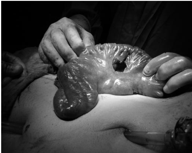
Fig. 4: Creation of a mesenteric window without compromising the vascular pedicles to the pouch limb.