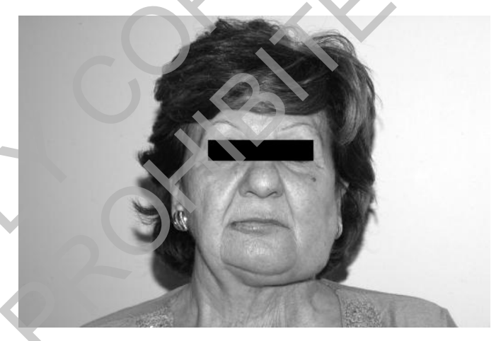
Fig. 4: Cosmetic result five months after the operation.

Nine months after the original operation the patients underwent a second RAI treatment, which did not produce any significant results.