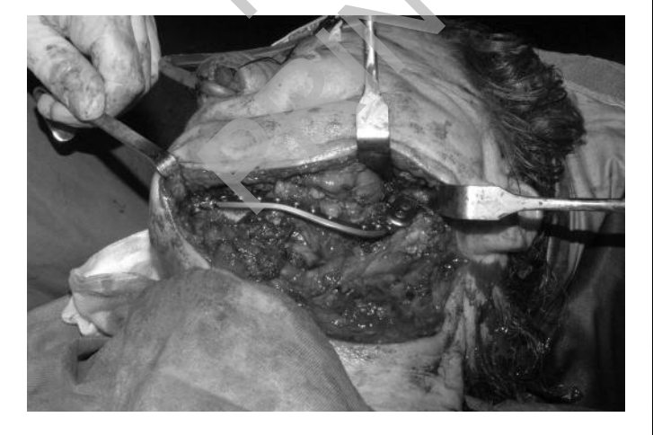
Fig. 3: Intraoperative view: left hemimandibulectomy completed. Positioning of the precustomized mandibular and condylar plate premolded.

One month after the resection, the patient underwent <sup>131</sup>Iodine ablation (120 mCi). The result of the scan, three days after this treatment documented the presence of cervical post-surgical thyroid residual tissue and the presence of metastatic lesions in the skull, right clavicle,