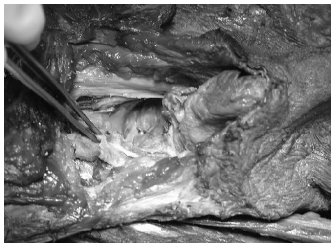
Fig. 6: Completion of dissection of ligaments.