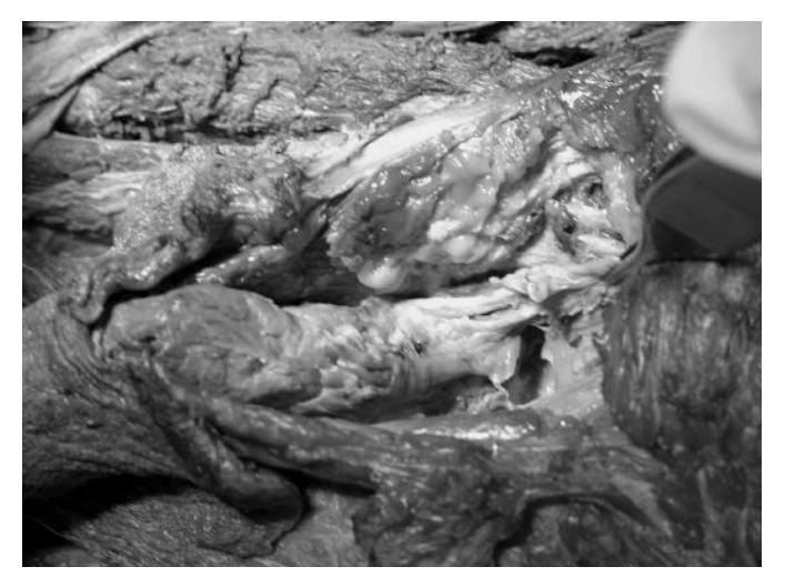
Fig. 3: The two branches of the triangular ligament appeared.