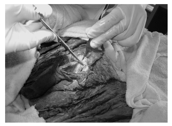
Fig. 1: Dissection of the fundiform ligament of the penis.

The anatomical study was performed in a human cadaver at the Department of Anatomy of Athens University. After removal of the skin and the fat from the area between the symphysis and the penis, the fundiform ligament can be identified as a continuation of the linea alba (Fig. 1). As one dissects deeper, this ligament continues as the triangular ligament of the penis (Fig. 2). The dissection of these ligaments mobilizes the penis allowing it to be pulled out once you apply a slight traction. The further the ligament is dissected the more the penis is freed. In