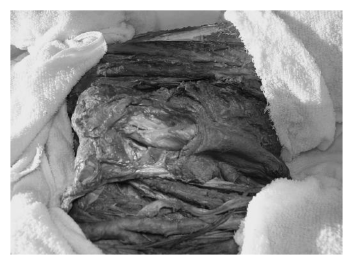
Fig. 2: Fundiform ligament dissected. Triangular ligament appearing.