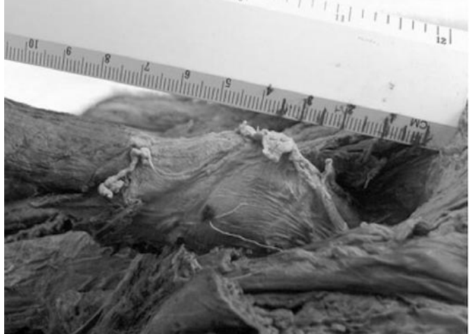
Fig. 7: Length gain in cadaver.