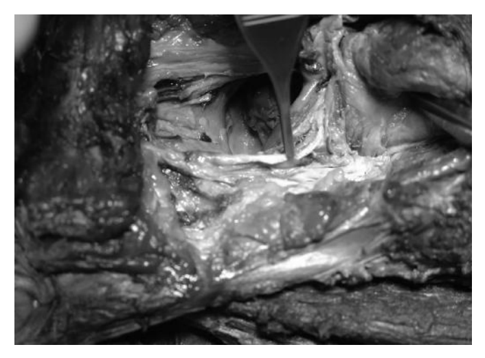
Fig. 5: Dissection of the triangular ligament. The inferior border of the pubic arch appeared.

a deeper plane, the ligament is divided into left and right branches which attach each crux to the pubic rami (figgs. 3, 4). While dissection continues (Figgs. 5, 6) the inferior border of the pubic arch, which is the limit where one should stop dissecting, lays deeper, behind this separation. At this stage the penis can be pulled out or in fact placed in a lower position (Fig. 7). By stopping the dissection at this stage, we do not risk creating a 'loose' penis even if in reality we are dealing with a penis that is now hanging a little bit lower than it used to be. It is important to note that, during the dissection one does not meet any vessel. Consequently the risk of bleeding during real operations is minimal.