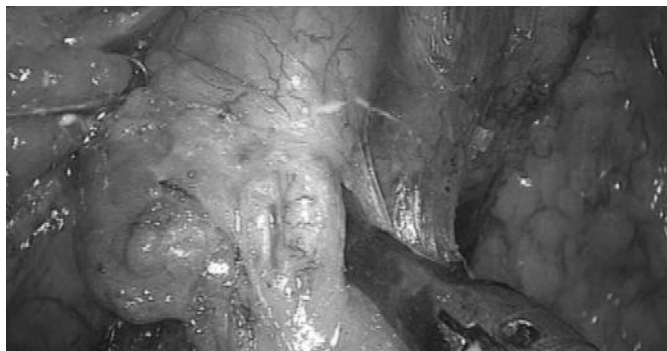
Fig. 2: Isolation of gastro-epiploic artery.