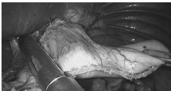
Fig. 5: Subtotal resection of the 4/5ths of the stomach.