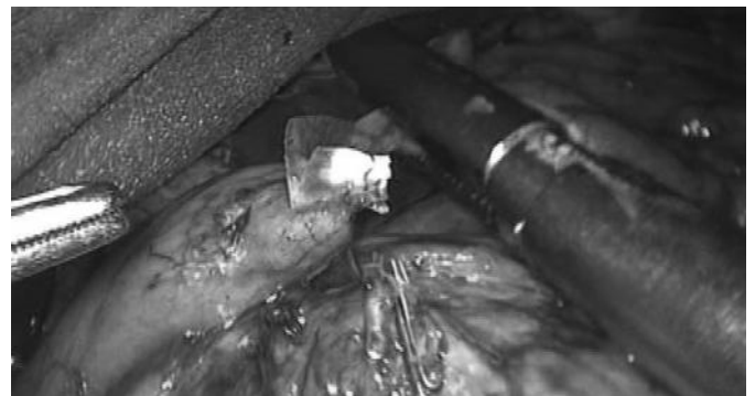
Fig. 3: Duodenal section with endoliner stapler 45 mm.