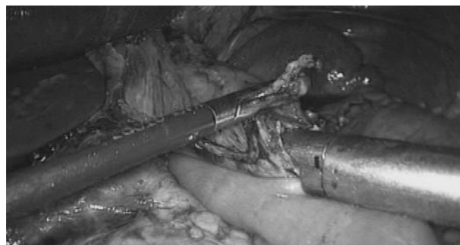
Fig. 6: Side-to-side Gastro-jejunal stapled anastomosis.

ic head, the Henle trunk is identified and the affluent right gastroepiploic vessels are isolated (Fig. 2) and divided separately between absorbable clips. This allows to clear tiers n.6 and 14v.