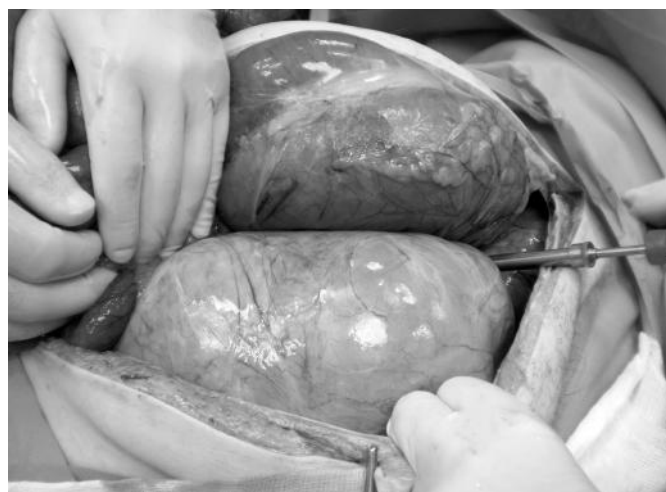
Fig. 3: Intraoperative view of megacolon during emergency laparotomy.

tive treatment in an attempt to soften the fecaloma, with repeated enemas and laxatives; the patient was placed in parenteral nutrition. After 72 hours the patient performing first very soft stools and after little hard stools; after five days the palpable mass on the abdomen was less tense on palpation, blood urea nitrogen and creatinine normalized, and the abdominal ultrasonography showed a discrete reduction of the left hydronephrosis. After seven days the patient suddenly had an acute abdomen, as mechanical bowel obstruction, with vomit and rapid deterioration of general conditions. The surgery was performed in emergency laparotomy, which was used to detect the complete obstruction of the intestinal lumen by the massive fecal impaction, probably moved by treatment with emollient laxatives and enemas (Fig. 3), and abdominal compart-