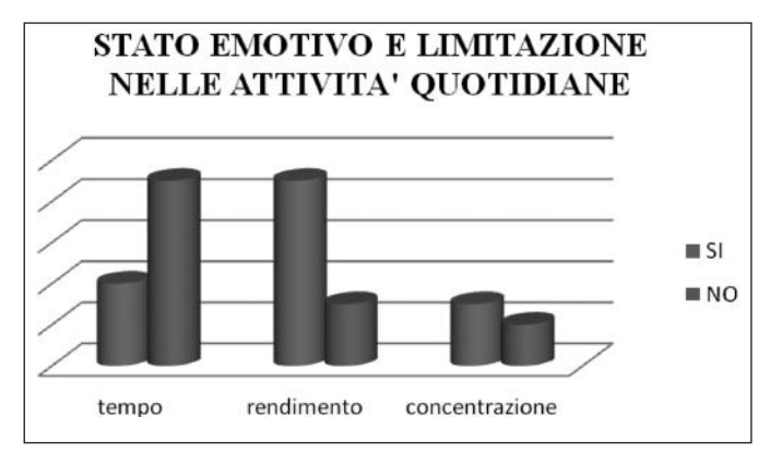
Fig. 2: Patients with chronic pain: relationship between emotional state and limitation of daily activities. Limitations of daily activities: less time dedicated to activities, lower productivity, poorer concentration.