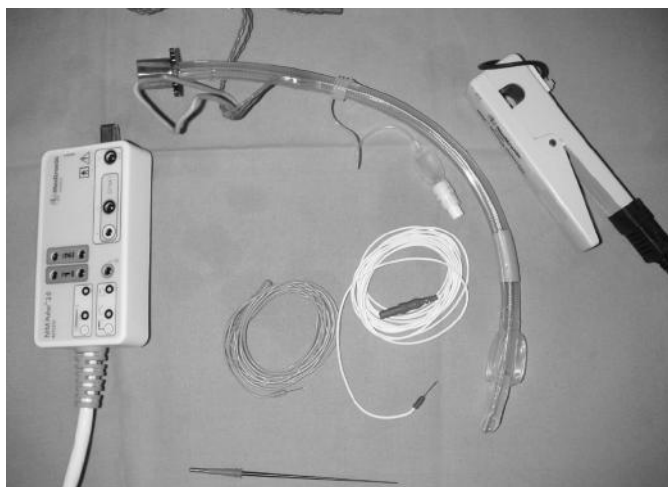
Fig. 1: Nerve Integrity Monitor – Pulse II®.

cheal tubes allowed continuous intraoperative assessment of vocal cord function when connected to an electromyographic (EMG) response monitor 12 . Hemmerling T.M. in 2001 proposed a adhesive stitch electrode to apply over the oro-tracheal tube. A new age in thyroid surgery was beginning 13 .