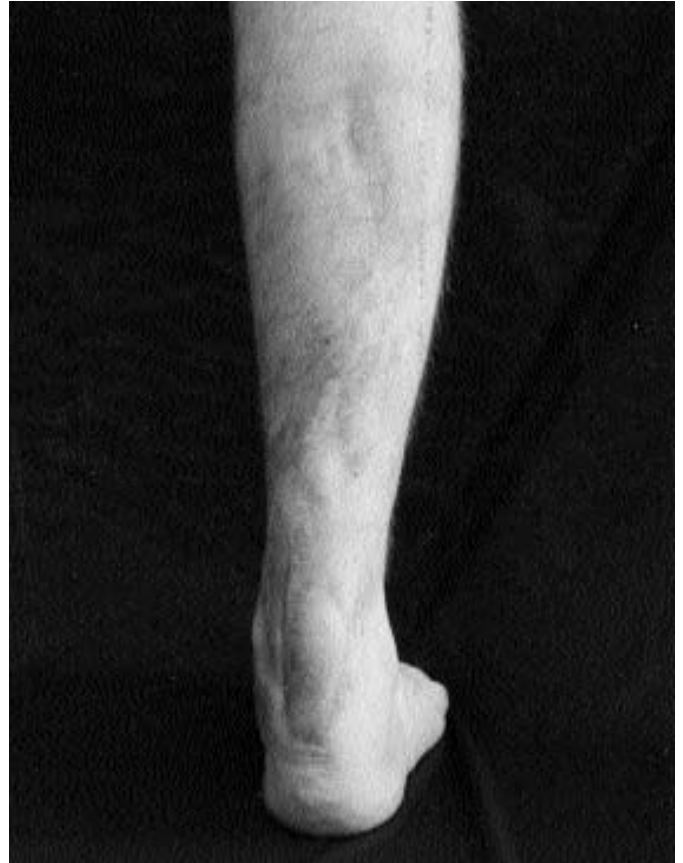
Fig. 7: Postoperative view at 1 year.

– a lower morbidity and better cosmetic quality of the flap donor area, which is repaired by directly closing the margins with no stress. It is important to preserve the dermal plexus when raising the skin flaps, however, so as to avoid any necrosis of the flap's edges;