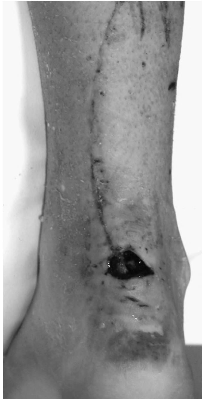
Fig. 1: Preoperative photograph showing the defect after Bosworth's reconstruction.

A 35-year old male patient suffered rupture of the right Achilles tendon during while playing soccer. He had surgery elsewhere involving a vertical skin incision and rotation of the central band of the Achilles tendon (Bosworth's technique). Postoperatively, he developed a significant