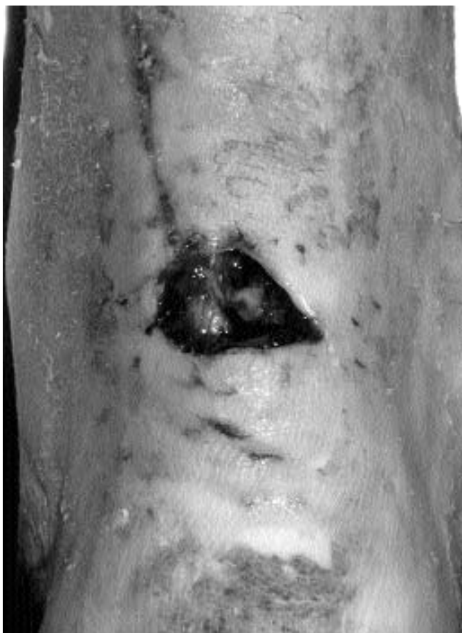
Fig. 2: Particular of the defect.

successful skin coverage in a mechanically-resistant tendon graft, while limiting cosmetic and functional sequelae in the donor area. Surgery was performed jointly by the orthopedic and plastic surgeons, was initially involved debridements, refreshing and curetting of the cutaneous edges of the exposure. Access was the previous surgical wound and dieresis was performed in layers. The Achilles tendon was isolated and its stumps (which were markedly separated) revealed severe degenerative phenomena. And extensive substance loss (Figg, 3 and 4). The stumps were adjusted and the Achilles tendon was reconstructed with a homologous gracilis graft passed through the two eyelets and sutured at the appropriate level of tension. The distally-based adipofascial sural flap was then prepared and used to cover the substance loss (Fig.5). The donor site was closed directly (Fig.6).