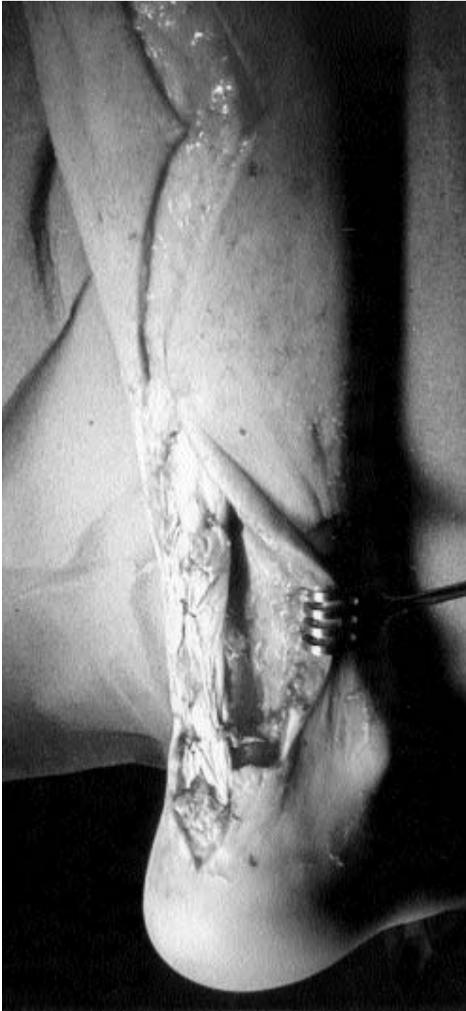
Fig. 6: Preparation of the adipo-fascial turnover sural flap.

We have opted for the adipofascial rather than the fascio-cutaneous variant because the former offers the following advantages: