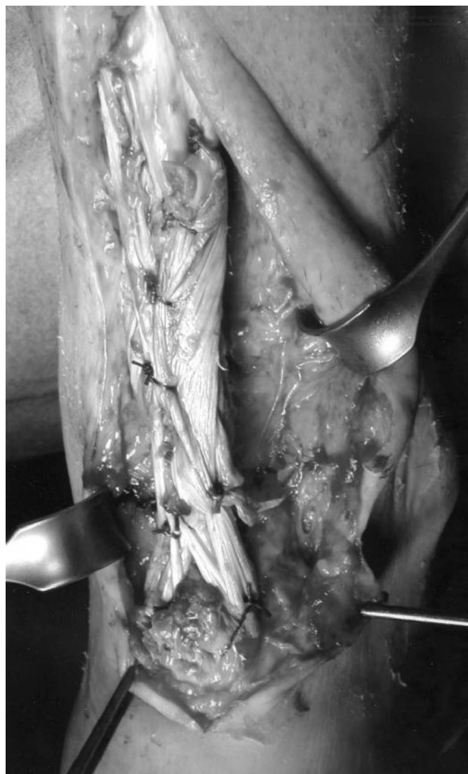
Fig. 5: Intraoperative photograph with the homologous gracilis graft secured in place and its covering by sural flap.

tion) make reconstruction with local flaps possible only for small defects, at the price of a high vascular risk and a large number of secondary complications.