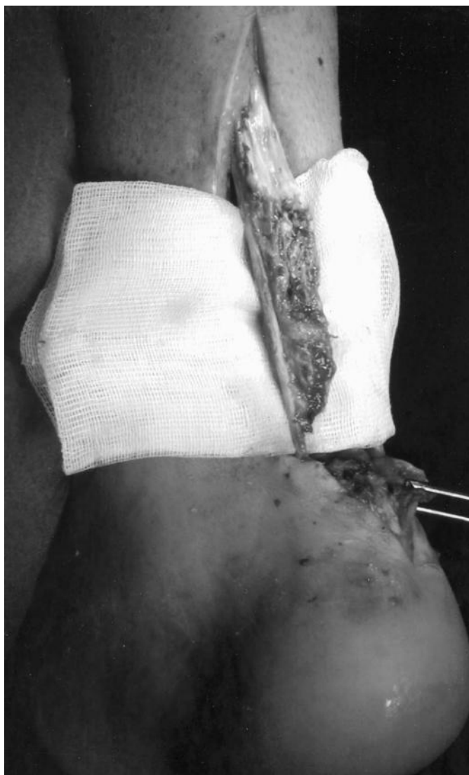
Fig. 4: Particular of the tendon substance loss.