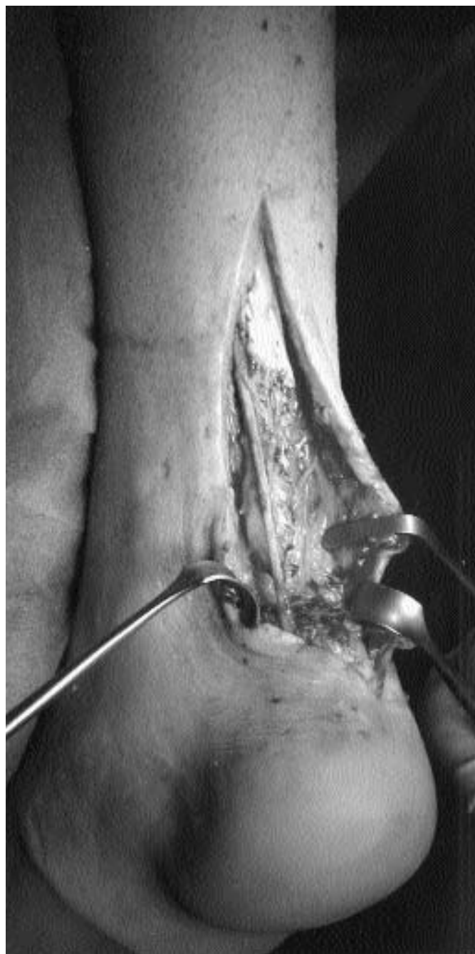
Fig. 3: Intraoperative photograph showing the tendon gap.

Two years on, the patient was resumed normal physical activities (Figs. 7 and 8) and the viability of the tendon graft was confirmed by MRI, performed two years after surgery with T1- and T2-weighted and FSE sequences, in the sagittal plan (Fig. 9).