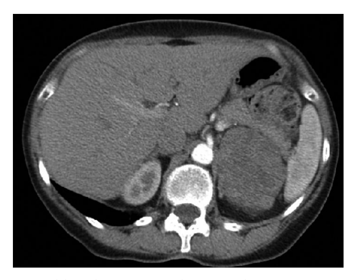
Fig. 2: Abdominal CT scan (December 2008): voluminous mass (7x5,5 cm) in the left adrenal gland.