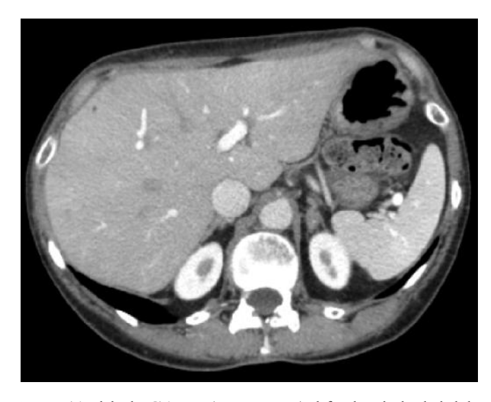
Fig. 3: Total body CT scan (January 2008): left adrenal gland slightly increased in volume and inhomogeneous, showing a microcalcification.

(G1), invading the submucosa, with a distance from the resection edge of at least 3 mm, but with features of hematic vascular invasion.