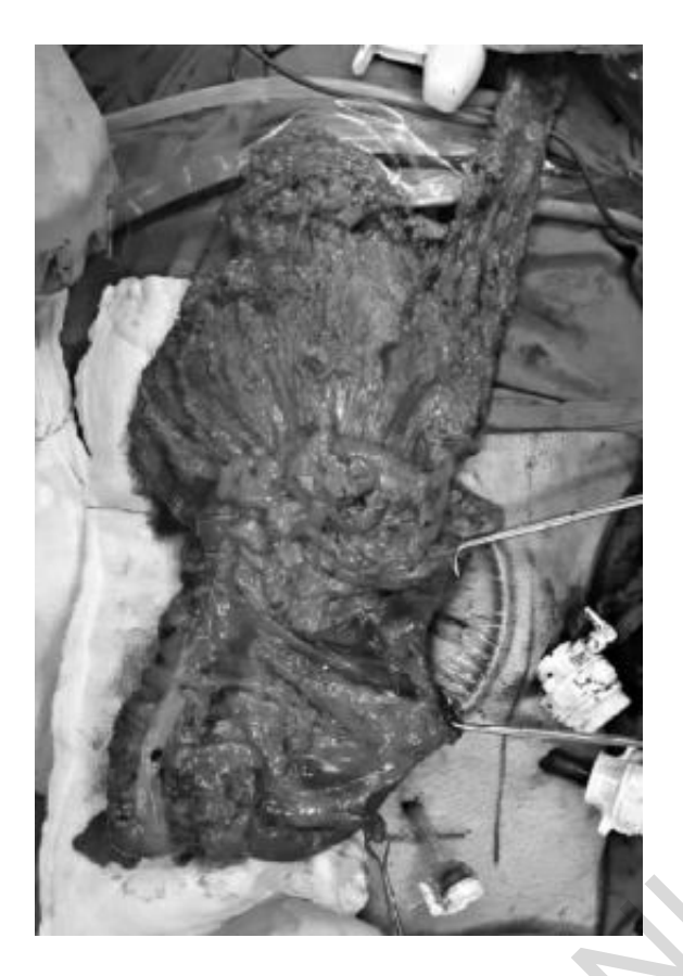
Fig. 4: Removal of the freed colon through the abdominal mini-incision made on the umbilicus by using a wound protector.

tively. Pathological evaluation was performed according to the 7th edition of the American Joint Cancer Committee (AJCC). Demographic data, intraoperative and postoperative parameters and histopathological results of both groups were compared.