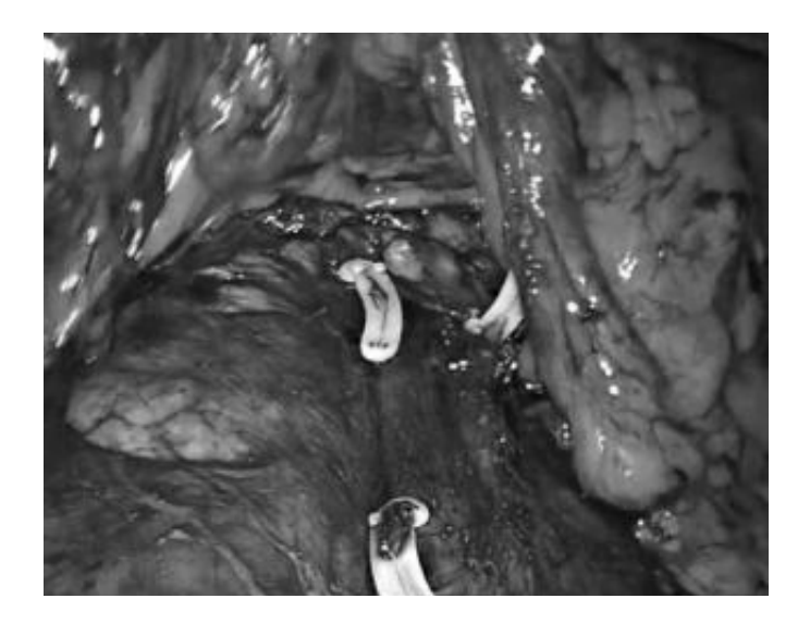
Fig. 2: Transection of the branches of the superior mesenteric artery and vein from their roots.