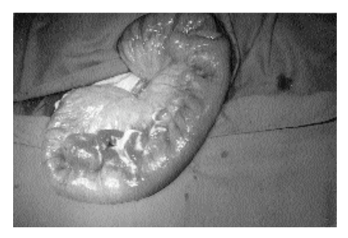
Fig. 1: Intraoperative photograph showing a jejunal loop suffering from diverticulosis and perforated diverticulitis.