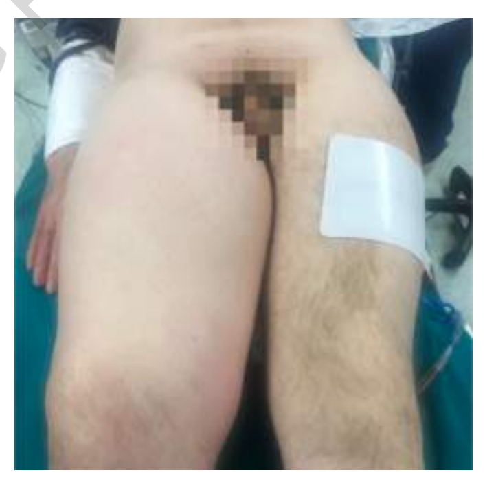
Fig. 1: Upon admission, physical examination showed severe edema and erythema of the right lower limb, extended from the gluteus down to the knee involving the anteromedial and posteromedial areas of the right thigh.