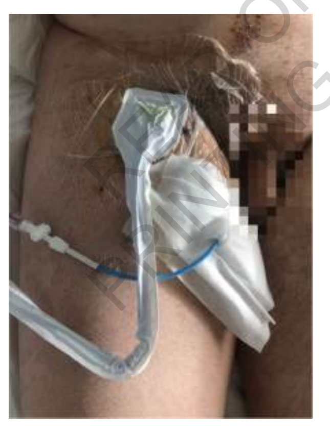
Fig. 4: Eight days after surgery, a vacuum-assisted wound closure device was placed on the right thigh, significantly improving wound healing.