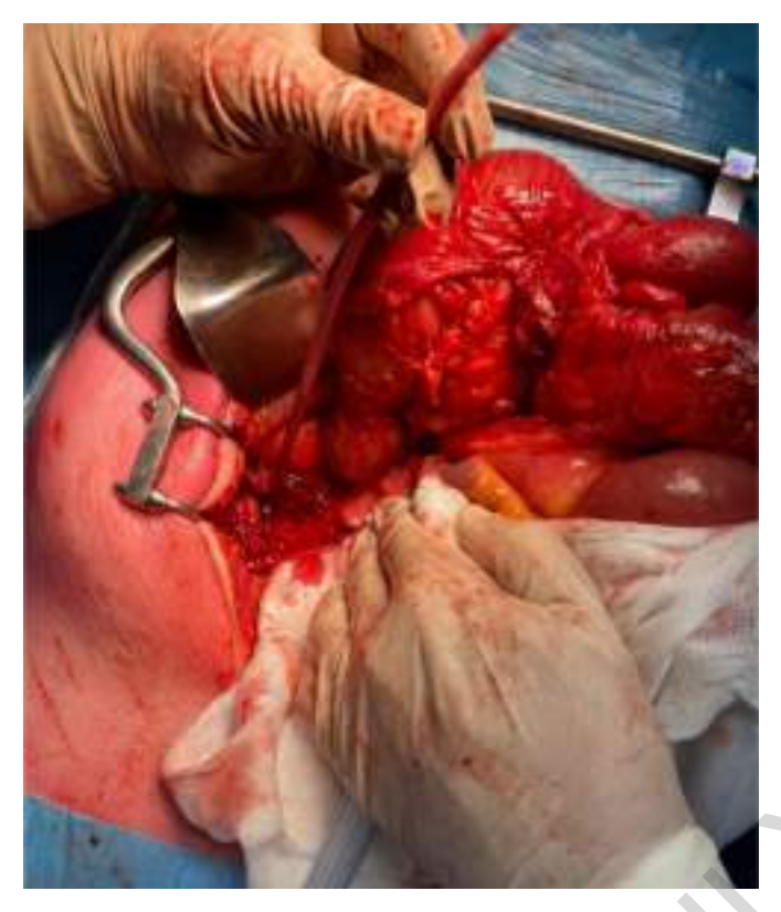
Fig. 3: Nelaton catheter introduced through the fistulous connection between the retroperitoneum and the iliopsoas right muscle.