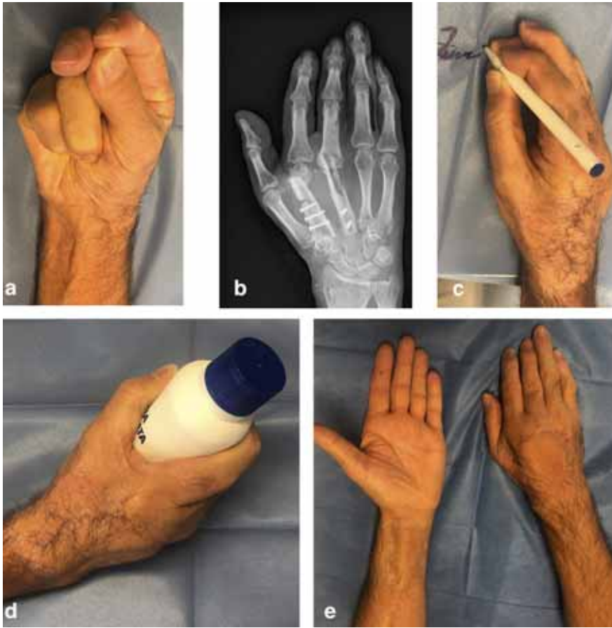
Fig. 4. Control at 18 months. A-C-D) Functional recovery with pinch and grasp movements. B) Control radiogram showing bone's full integration. E) Aesthetic outcome.

allowing return to work 8 months after the trauma. All the surgeries were performed by the same team, composed by a senior plastic surgeon and the assistant residents, under general anaesthesia and arm tourniquet.