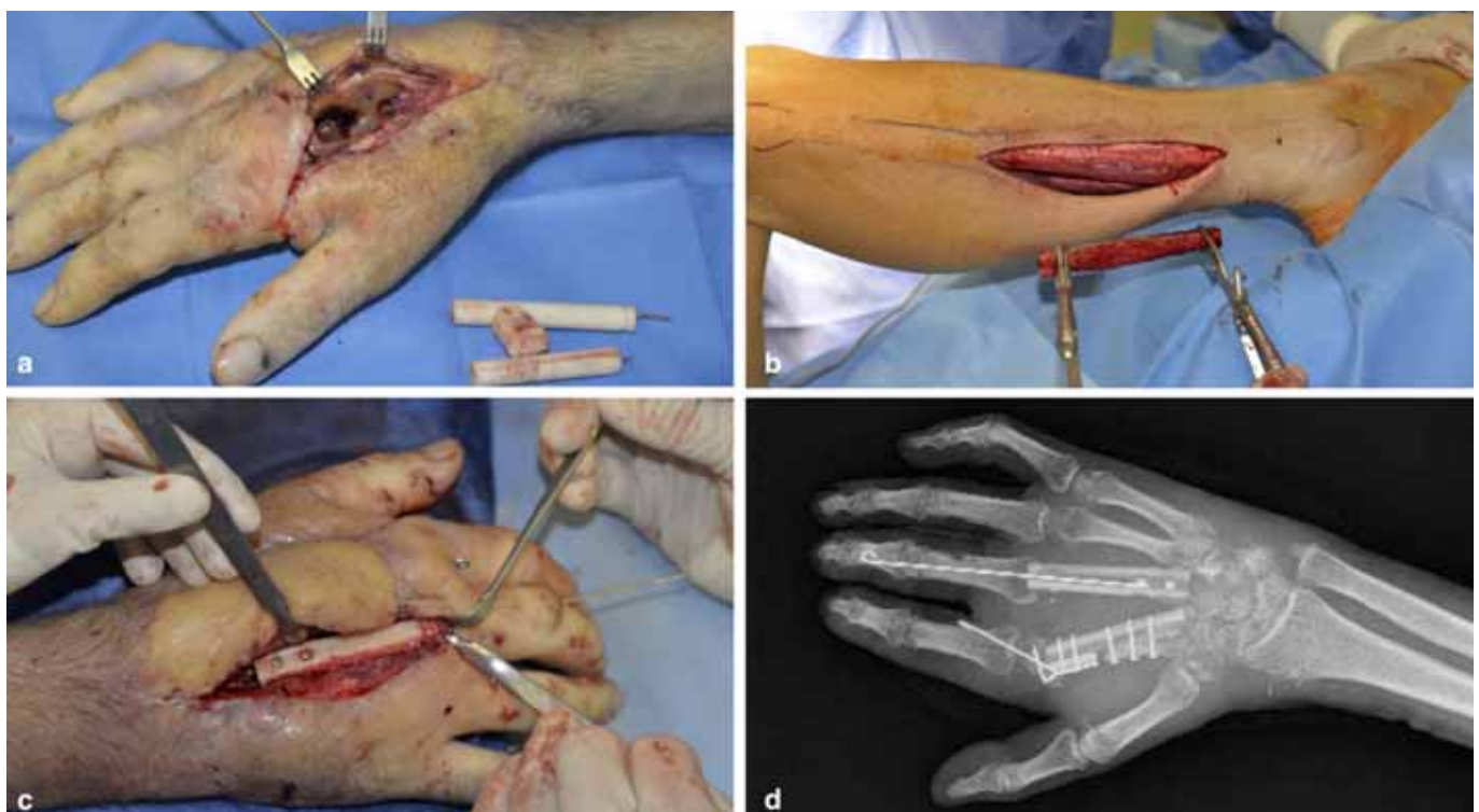
Fig. 3. Second reconstructive stage. A) Removal of the cement spacer. B) Harvest of the fibular cortical graft. C) Insetting the bone grafts into the recipient site. D) Immediate post-op radiogram.