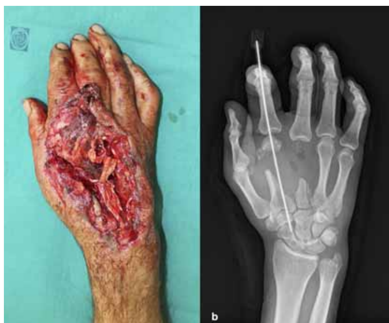
Fig. 1. A) Acute trauma showing loss of cutaneous and subcutaneous tissues. Extensor tendons for the 2nd and 3rd digit appear extensively compromised. B) Radiogram after initial debridement showing the bony gap at the 2nd and 3rd metacarpal bones.

18-months follow-up showed an effective morphofunctional outcome. Bone grafts fully integrated, sensitiveness of the dorsum, flexor and extension functions were satisfactorily restored (Fig. 4 A-E). The patient was able to use his hand without further significant impairment,