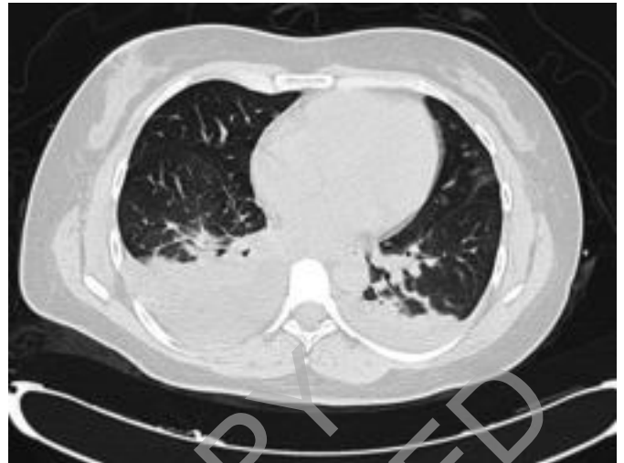
Fig. 3: CT scan (two days after trauma) showing bilateral pulmonary contusion and right pleural effusion.

injury, the patient was admitted to our Emergency Department. She was conscious, but her physical examination revealed pallor, marked dyspnea, tachypnea (Respiratory Rate 24/min), tachycardia (Heart Rate 104 bpm), intense right upper quadrant pain and blood pressure (BP) of 90/60 mm/Hg. She received intensive fluid administration (2000 cc crystalloid intravenous fluid) with prompt recover of blood pressure (130/70 mmHg) and heart rate (84 bpm). Chest examination showed bruises and crepitation on right hemithorax for multiple rib fractures and there was abdominal tenderness without signs of peritoneal irritation. Laboratory and arterial blood gas (ABG) analyses showed normal values, but haemoglobin 11.2 g/dl (normal range 12.0-15.5 g/dl),