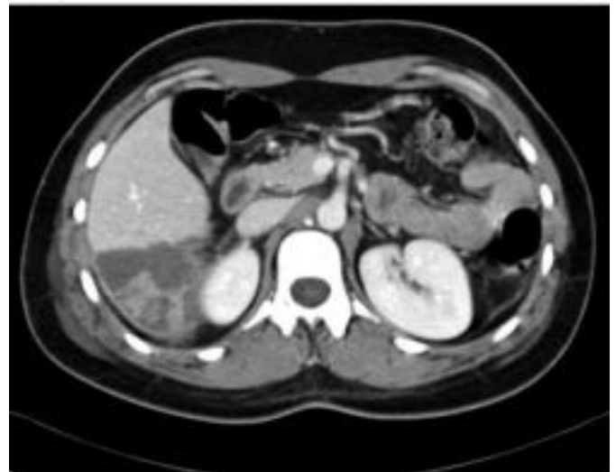
Fig. 4: CT scan (seven days after trauma) showing volumetric reduction of the liver lacerations, which appear to be more hypodense in relation to phenomena of parenchymal necrosis.