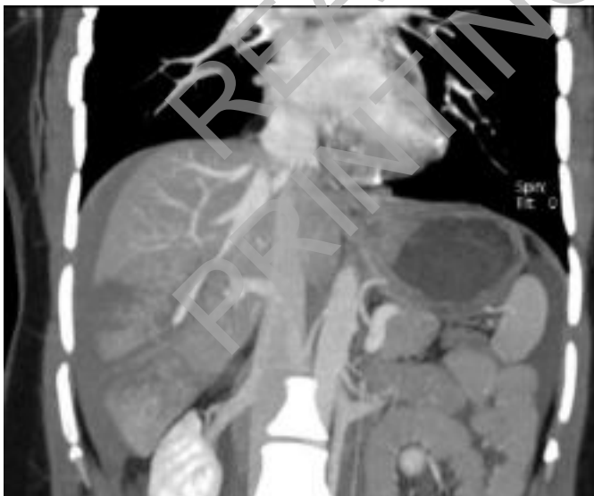
Fig. 2: CT scan (coronal view) – Some peripheral ramifications of the right branch of the portal vein are unrecognizable; in addition, one of the branches of the right suprahepatic vein appears reduced at its middle third and only distally returns to its regular caliber.