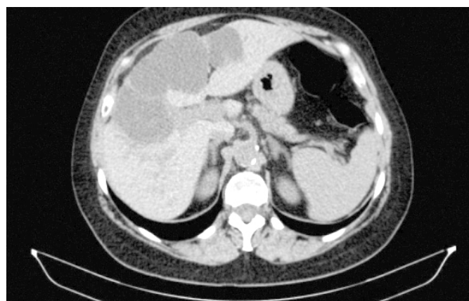
Fig. 4: Abdomen CT scan case 3.

Surgery included cyst wall puncture by using sand balloon catheter, aspiration, and injection of anhydrous alcohol using a volume equivalent to 10% of the capacity of the cyst (Fig. 3). Ten minutes after the injection, ethanol was removed, followed by deroofing using energy device.