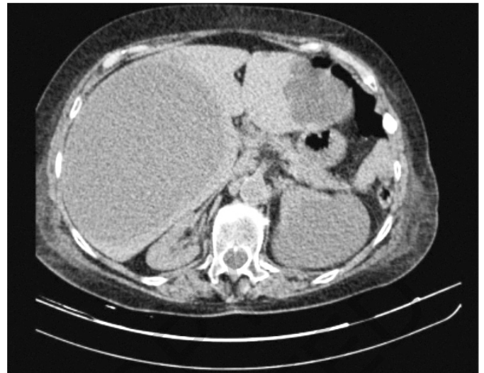
Fig. 1: Abdomen CT scan case 1.

86 year old woman admitted to our surgical Unit because of high fever > 38°, numerous episodes of vomiting, right lung consolidation associated with bilateral pleural effusion, a strongly reduced GCS 8/15, WBC: 19.000, PCR: 150 subjected to antibiotic therapy for about 12 days . Abdomen CT scan shows: multiple hepatic cysts of which the largest one measured 12 x 15 cm occupying almost the entire right hepatic lobe (Fig. 1).