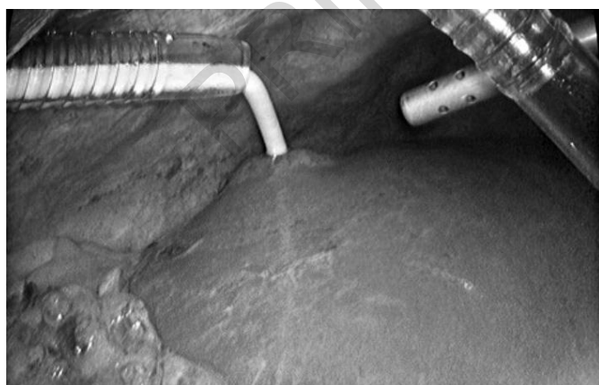
Fig. 3: Injection of anhydrous alcohol.