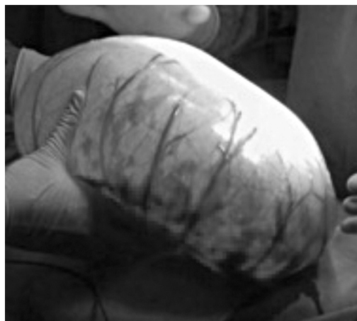
Fig. 2: Bowel Obstruction. Considerable transverse colon dilatation due to obstructing sigmoid cancer.